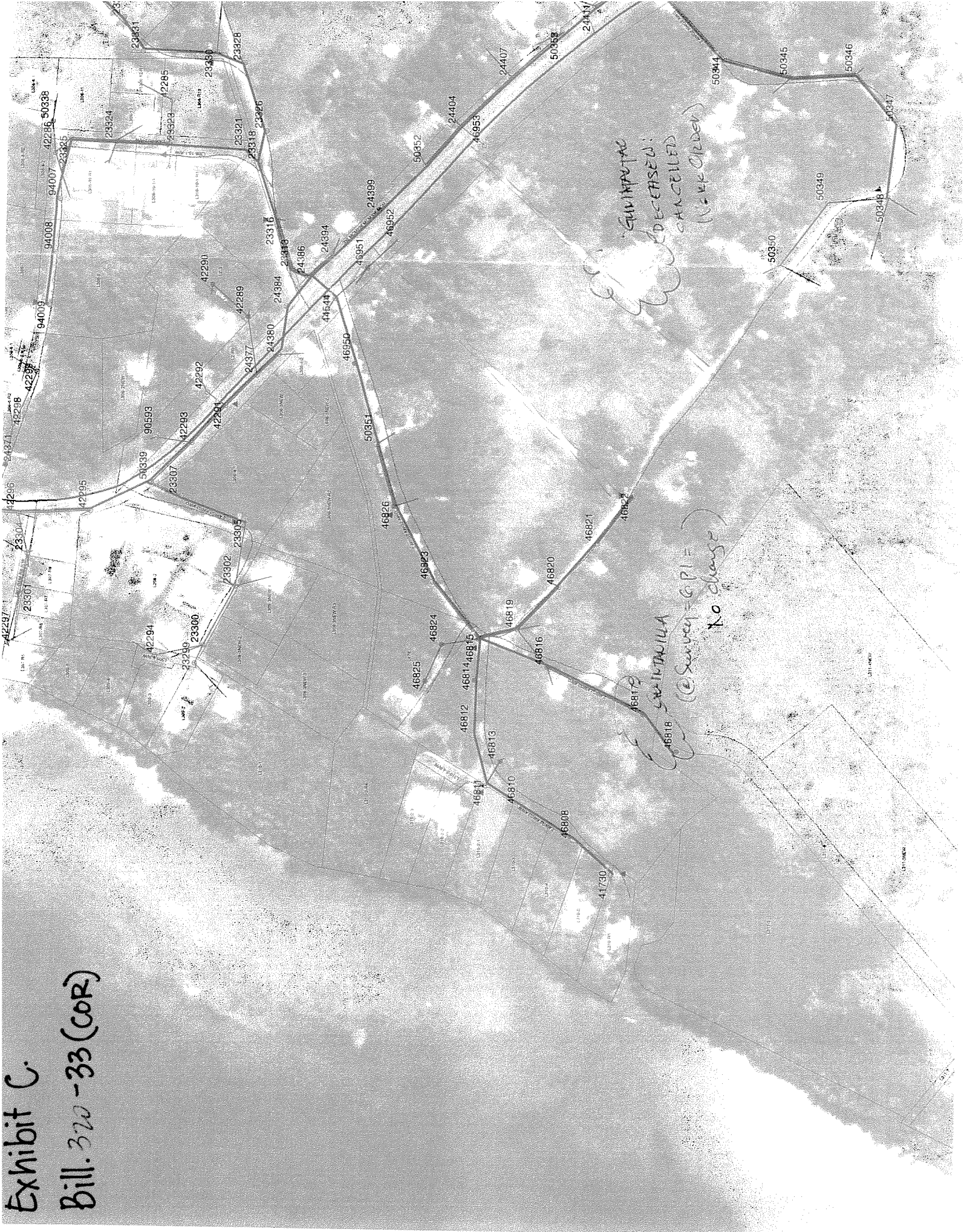
Exhibit C Bill. 320-33 (COR)